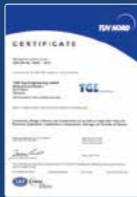
DIN EN ISO 14001:2015