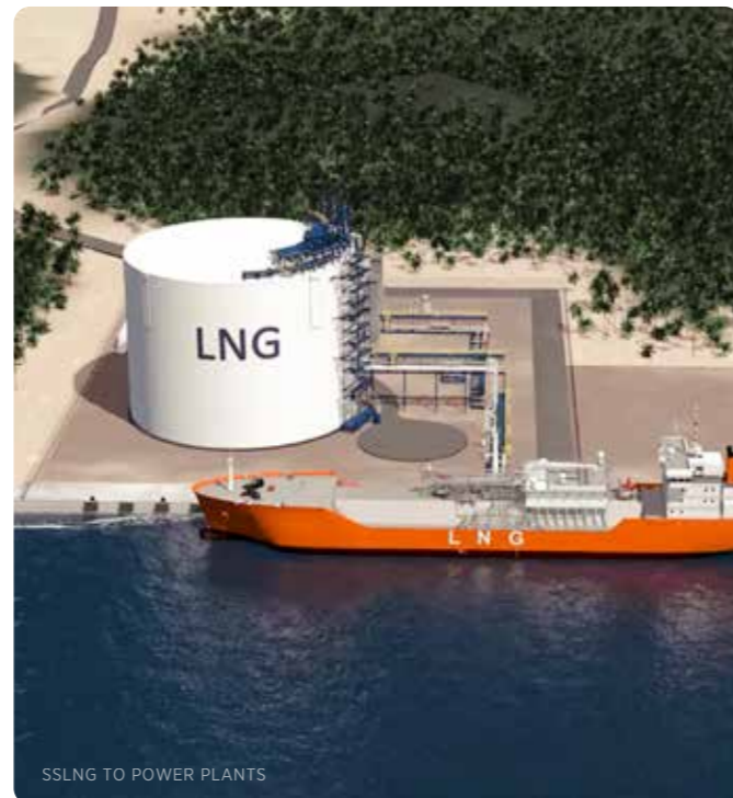
SSLNG TO POWER PLANTS