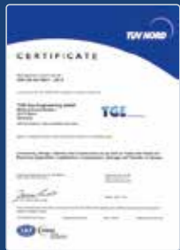
DIN EN ISO 9001:2015

When it comes to quality, we don't believe in compromise. Providing our partners with top-quality products and services is a key element in our continued success. We rely on rigorous and effective quality management to ensure consistent performance on the highest level. For example, we have organized our management system in compliance with ISO 9001, ISO 14001, ISO 45001 and in particular ISO / TS 29001, a quality management standard specifically for product and service supply organizations in the petroleum, petrochemical and natural gas industries.